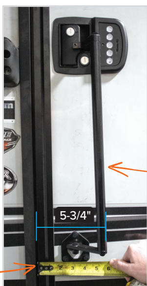
Outer edge of the Latch Extender