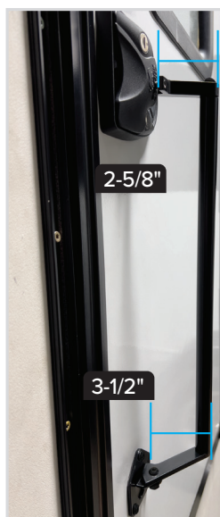
2-5/8" off the face of the latch

A total width of 5-3/4" clearance is needed from the edge of the door to the outer edge of the Latch Extender.